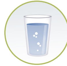
Cup of water