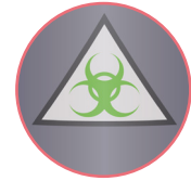
Toxins & pesticides