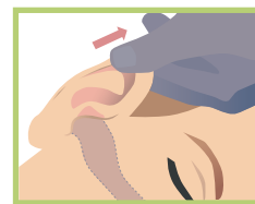
UP and back in adults