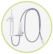
IV administration tubing