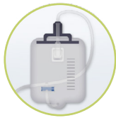
Urine collection bag