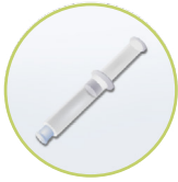
Sterile water syringe